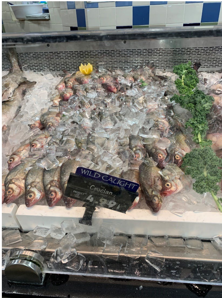
Figure 3. Fish labeled "Wild Caught Crucian Carp" for sale at a market in Chicago suburbs, ISU investigated, and no violations were observed.