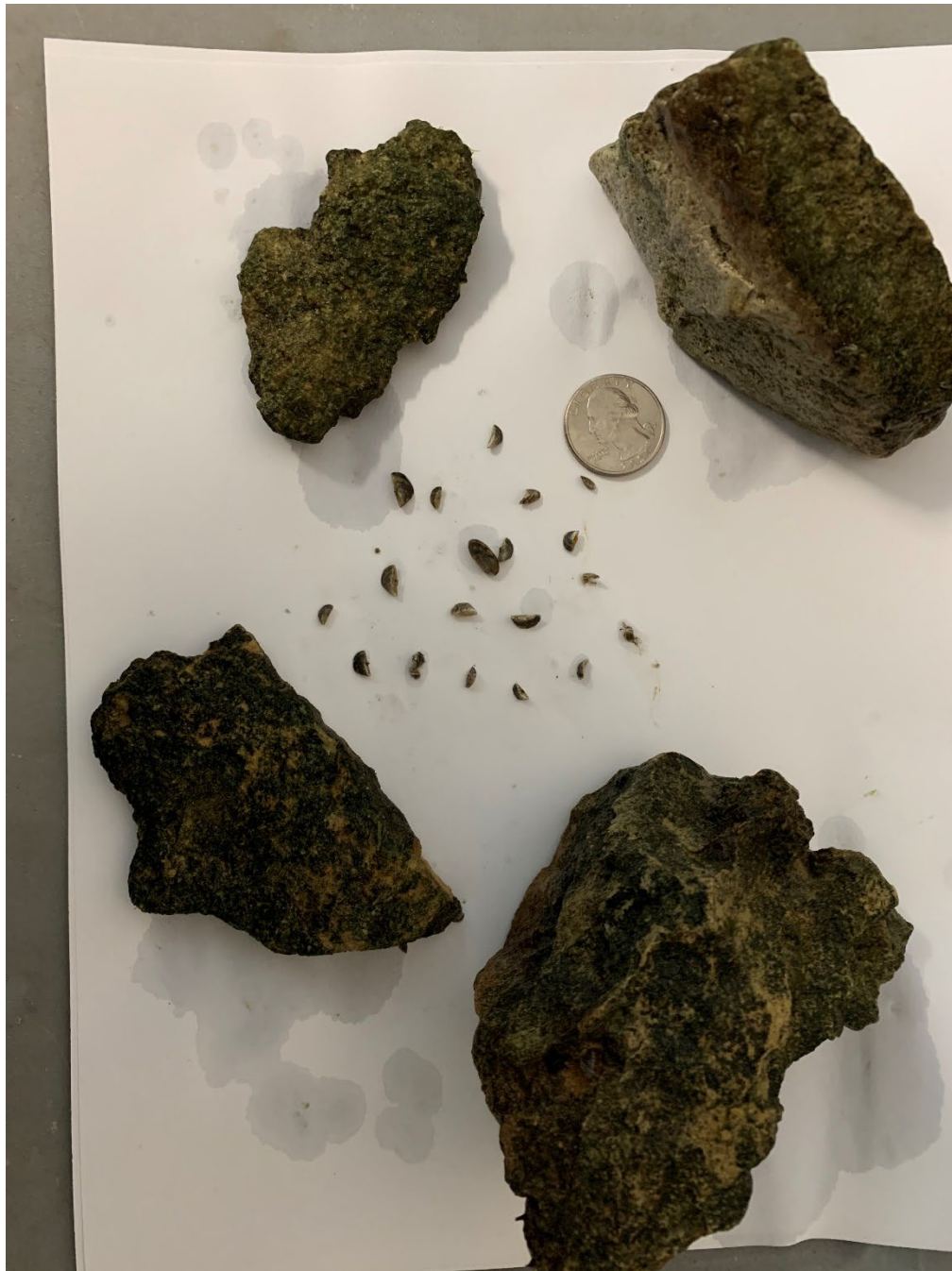
Figure 2. Rocks with zebra mussels seized during an ISU investigation.

During the month of March, ISU conducted an inspection of an aquaculture facility in Lake Forest, IL. The facility was seeking approval to raise a non-approved species for aquaponics purposes. No violations were detected, and approval for an aquaculture permit was recommended. ISU investigated a complaint of two separate fish farms in Florida illegally shipping tilapia into Illinois without the required permits. Both companies were provided IDNR importation regulations for fish importation, but no citations were issued. ISU located fish being sold at a market in the Chicago suburbs that were advertised as wild caught Crucian carp. A search of the business didn't locate any live species at the location, and it is uncertain that the fish were Crucian carp. Species are often mislabeled at these markets. No violations were observed.