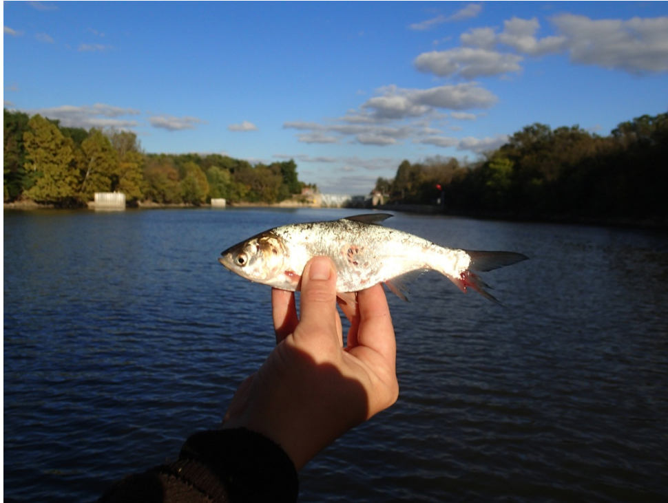
Figure 2. Juvenile Silver Carp measuring 203mm caught in the Starved Rock pool downstream of the Marseilles lock (41.32868, -88.75505).