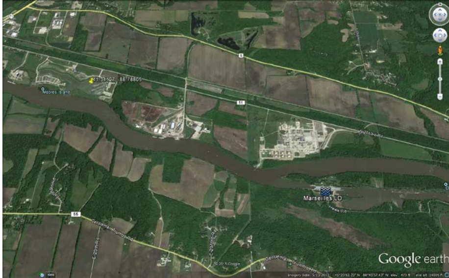
Figure 2. Location of Heritage Harbor Marina, in Starved Rock Pool, relative to Marseilles Lock.