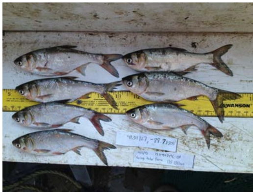
Figure 1. Small silver carp captured by electrified paupier in Heritage Harbor in Starved Rock Pool during September 2015.

A FWS crew from Columbia FWCO also captured 17 small Asian carp (135-150 mm TL) in upper Starved Rock Pool using electrified paupier (Figure 1). All were captured in Heritage Harbor Marina, which is just over 2 miles away from the Marseilles Lock (41.34127, -88.78805; Figure 2). Additional specimens were captured throughout September by Columbia FWCO.